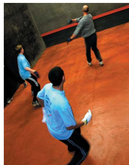
Derby Moor College's fives courts were renovated just three years ago