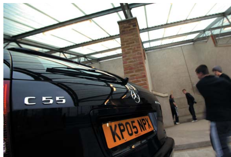
The C 55 AMG Estate tackled a mix of urban and cross-country routes between fives centres in London, Derby and Manchester