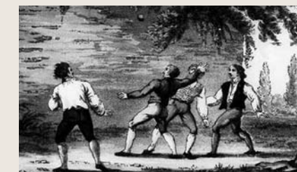
Fives was first recorded in the 16th Century

Eton Fives, however, can only be played in pairs as the court is modelled on the steps of Eton College Chapel, where the game originated. It features a step in the floor and a large buttress sticking out from the left-hand wall, but no back wall.