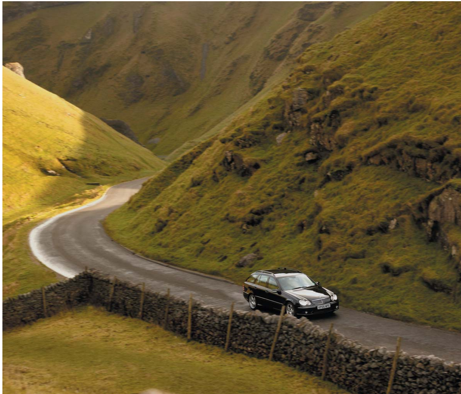
■ With blistering performance and sharp handling the C 55 AMG Estate is a joy to drive

beauty of the C 55 AMG is that, when we get an opportunity to pass, we can take it. Just as a fives player waits for the right moment to pounce and hit the winning shot, so we wait for the road ahead to clear and then react. Flick down a couple of gears, floor the throttle and, in an instant, we're past.